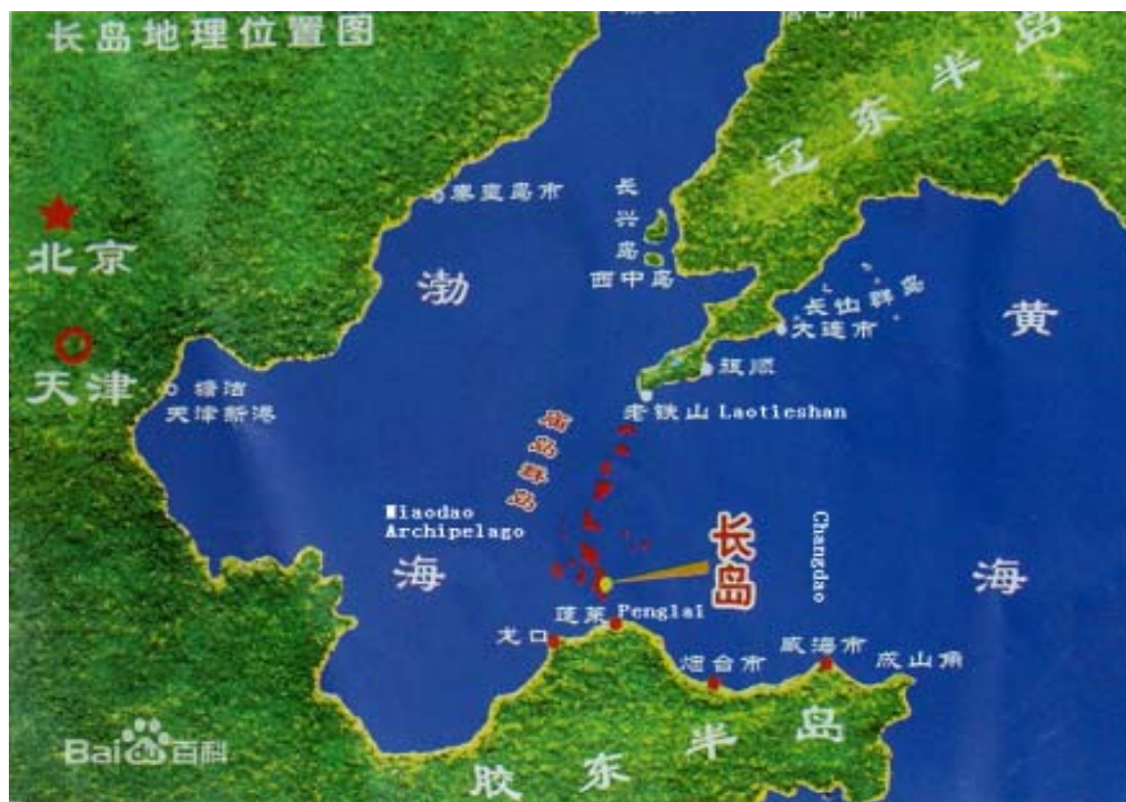
location map of Bohai-sea

The separating line between Bohai Bay and Yellow Sea is the line (marked in red in below map) from the west corner of Lao Tie Shan (approximately 38^{\circ}43.663N , 121^{\circ}08.082E ) located in the south of Liaodong peninsula to Peng Lai Jiao (approximately 37^{\circ}49.931N , 120^{\circ}44.575E ) located in the north of Shandong peninsula via Miaodao Archipelago.