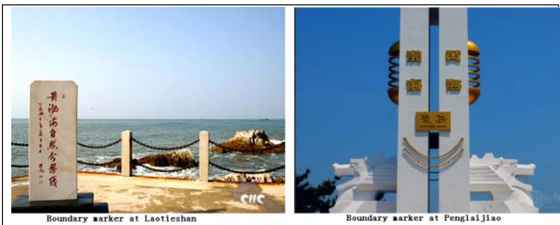
Boundary marker at Laotieshan

According to the Declaration by the Government of People's Republic of China on the Territorial Seas, Bohai Bay is the inland sea of China.